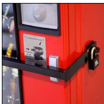
Door strap preventing unauthorised access