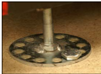
Standard security foot

Keep your customers and machines safe from rocking, tilting and theft.