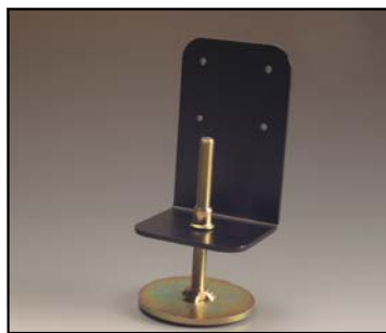
Standard wall clamp