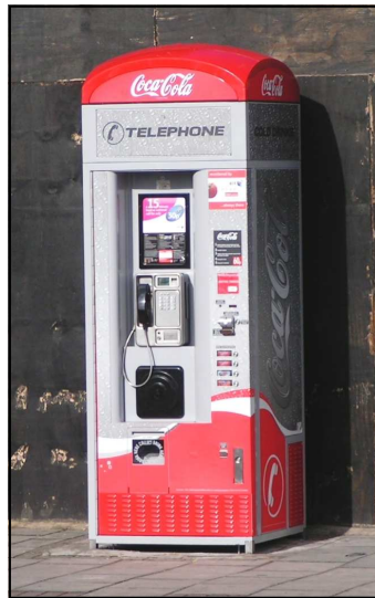
Combined BT Phone & Vending Booth (above)

To accommodate your precise needs, Safer Systems offers a dedicated Design & Engineering Service, ensuring you receive the products you need, when you need them.