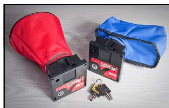
Internationally acclaimed Custodian self-locking cash bag (above)

Safer Systems offers a custom-made design service, which specifically addresses the individual needs of each customer's product or security problem.