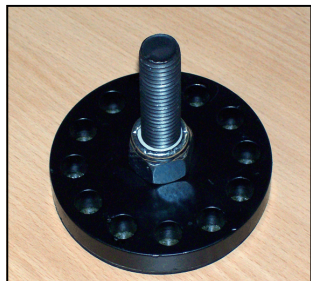
New design bolt-down machine foot